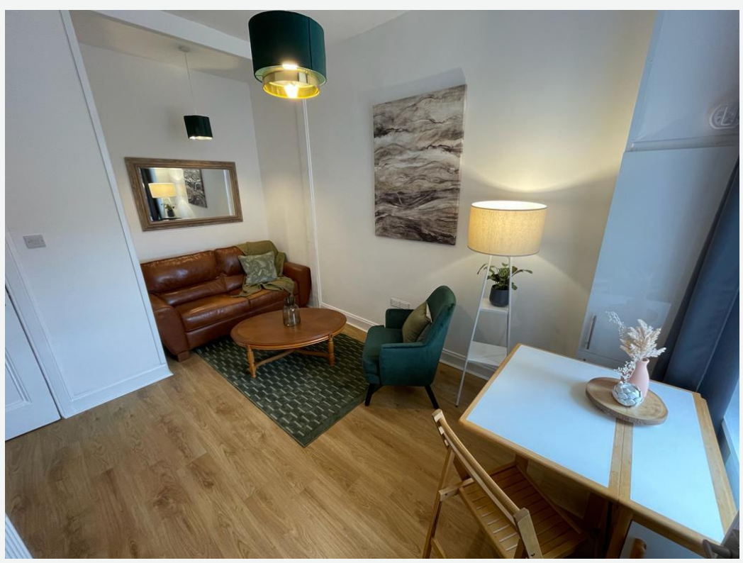
Before and after pictures of a recent renovation by Homes for Good Scotland