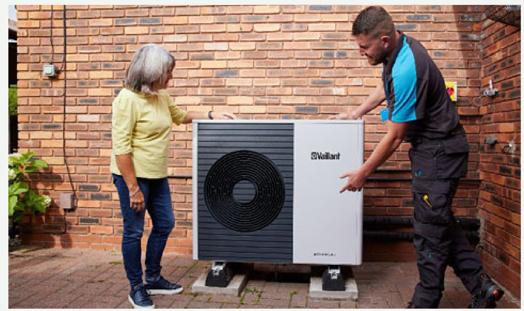
British Gas installing a heatpump under the 'Boiler Upgrade Scheme' (BUS), administered by Ofgem

Additionally, the measure has a relatively high administrative cost. While insulation measures are more beneficial over