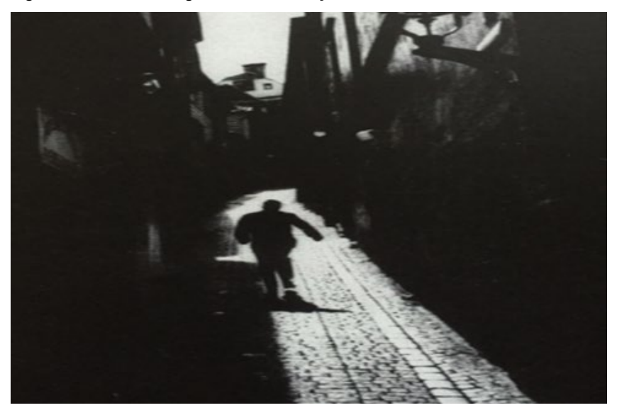
Figure 7: Person walking down a dark alley