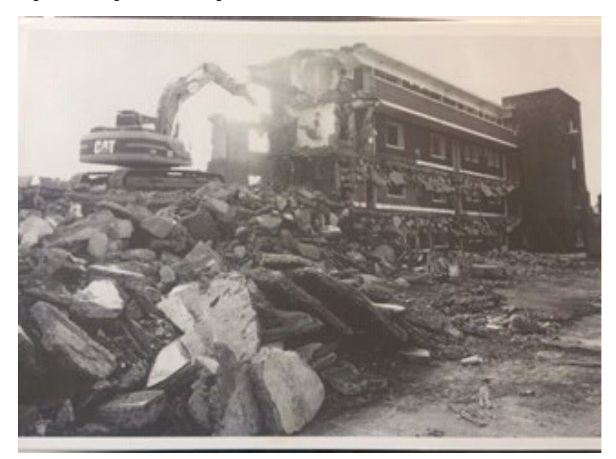
Figure 1: Image of a building site