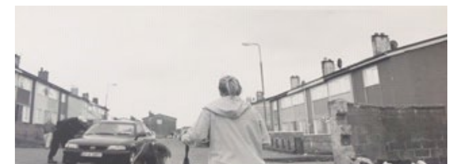
Figure, 2: Woman pushing a pram past some rubble