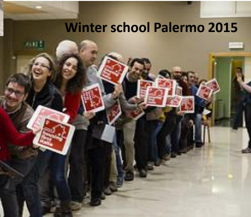
Winter school Palermo 2015