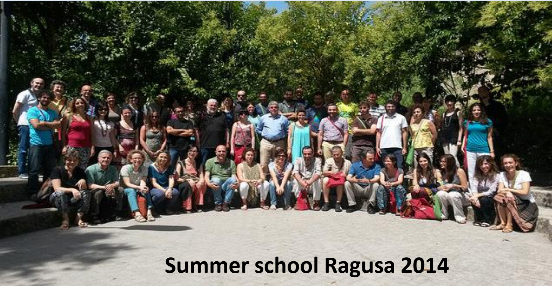
Summer school Ragusa 2014