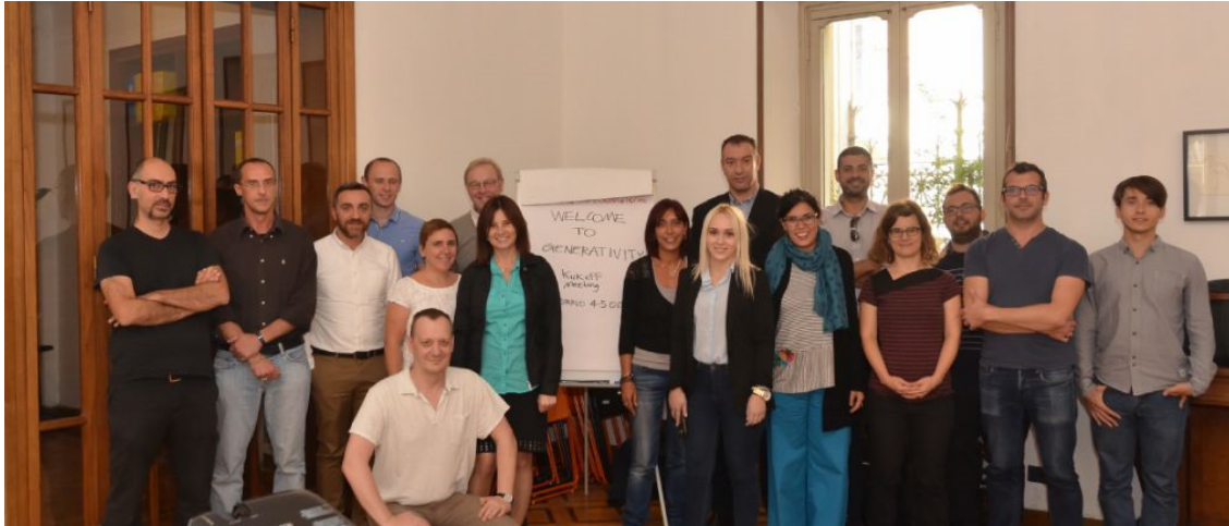
Generativity kick-off meeting Turin, October 2016

We hope you will find it a useful and informative read!