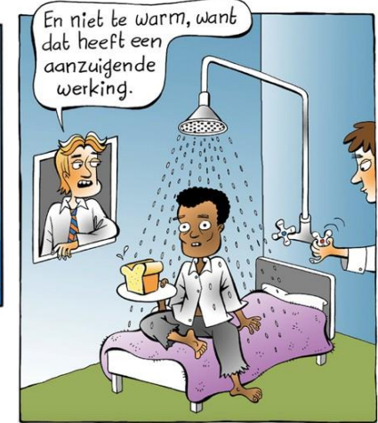
Zeur & Zanik

zouden zich van schaamte in hun graf omsdraaien als ze daar al in lagen